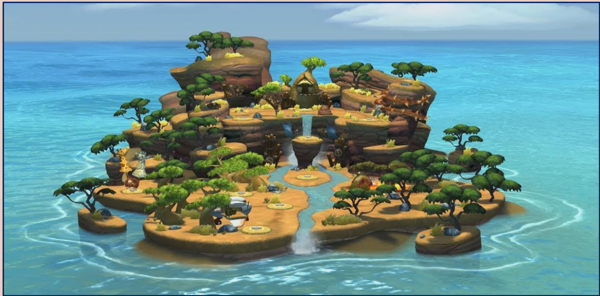
Figure 1: World 3 “Bright Savanna” from Donkey Kong Country: Tropical Freeze, the inspiration for the theme of the map.

The logo of the map was also inspired by the same game, but this time its loading screens (Figure 2). I always thought that their silhouette style looked really nice, so I choose to apply this style to this map as well.