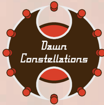
Figure 3: Logo of "Dawn Constellations", a company which has a prominent role in two of my scrapped maps.

The company, for which Salvadore Theoplia works (as indicated on his tent), is called Dawn Constellations. This is a company I used in two scrapped maps of mine called “Time Defect” and “Testing Track: Eta Aurora” (see Figure 3 for the company logo). Maybe one day, I will release a map in which this company plays a more prominent role.