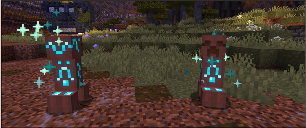
Figure 4: "Ghosts", as they would have spawned, if the map were to be played in night mode.